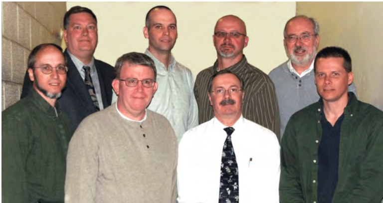
Mid Hudson, NY Region (L to R)