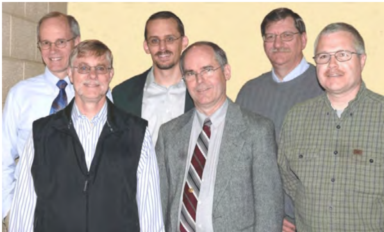
Pocono Region (LtoR)