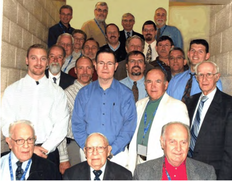
Capital Region (LtoR)