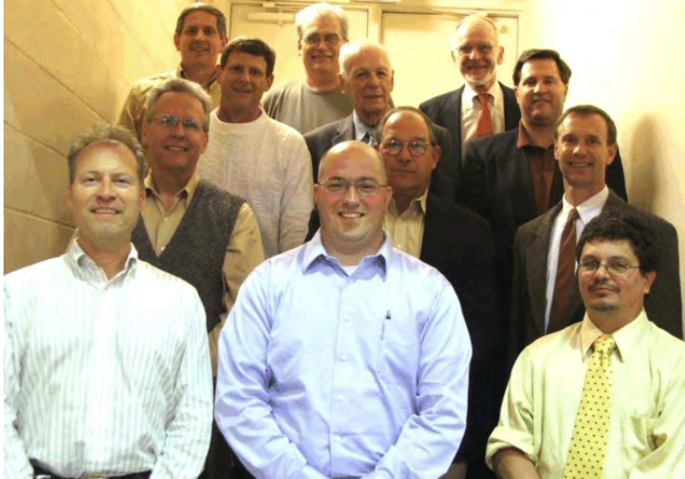
Lehigh Valley Region (LtoR)