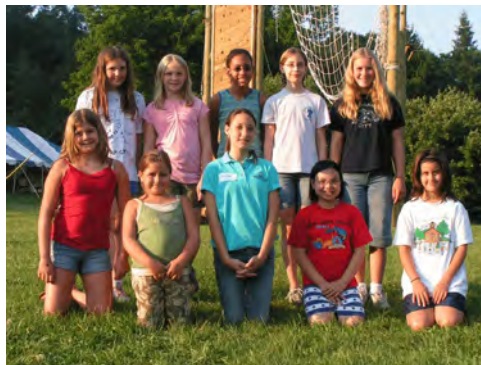
Figure 39 Girls' Cabin at Victory Valley Camp