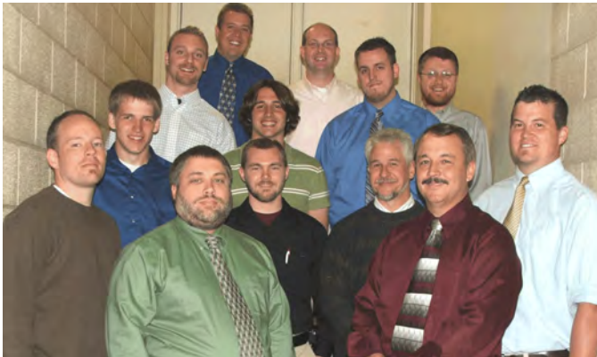
Figure 42 Annual Conference Pages (L to R)