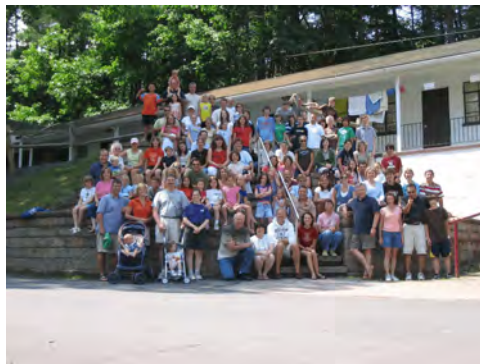
Figure 52 Campers from Bethlehem