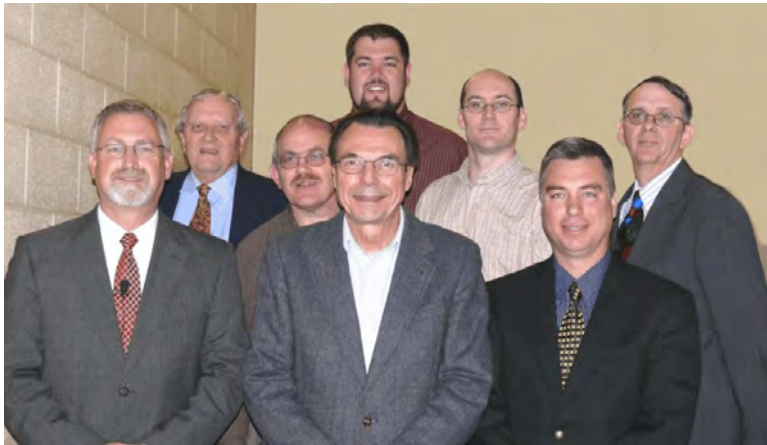
New Jersey - Delaware Region (L to R)