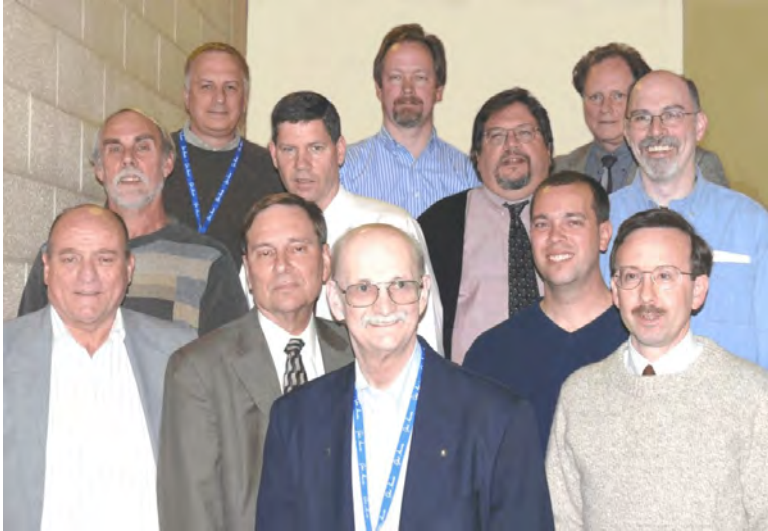
Metro Region (L to R)