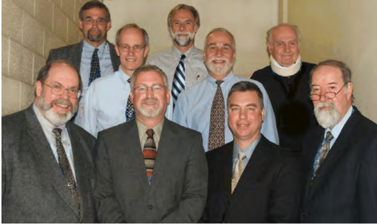
Annual Conference Officers: (L to R)