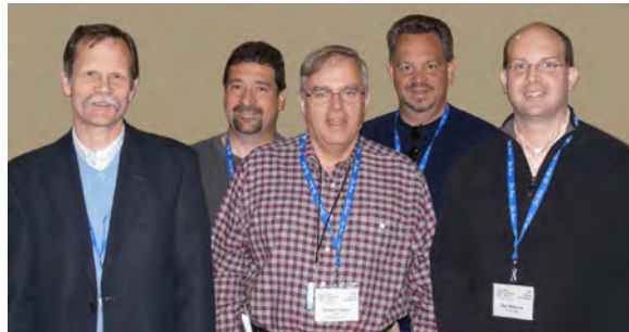
Philly-Area Region (LtoR)