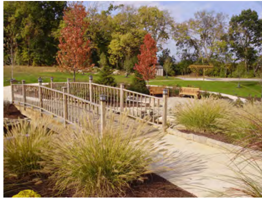
Figure 30 Bridge in new park at Fellowship Community