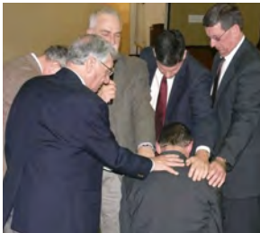
Laying-on of hands.