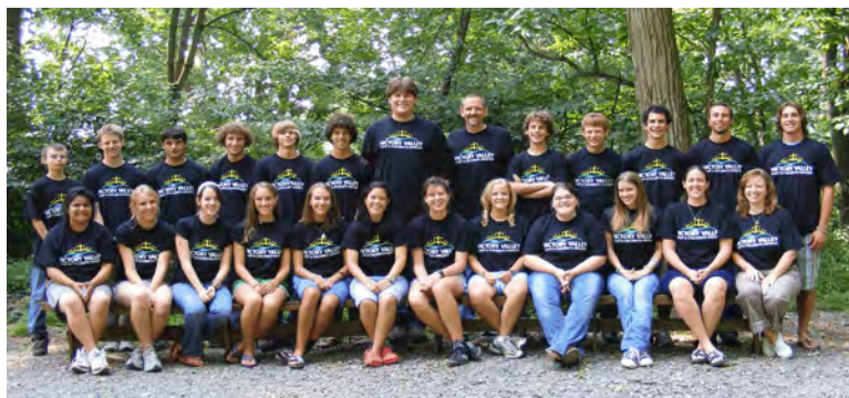
Figure 40 2007 Summer Staff at Victory Valley Camp