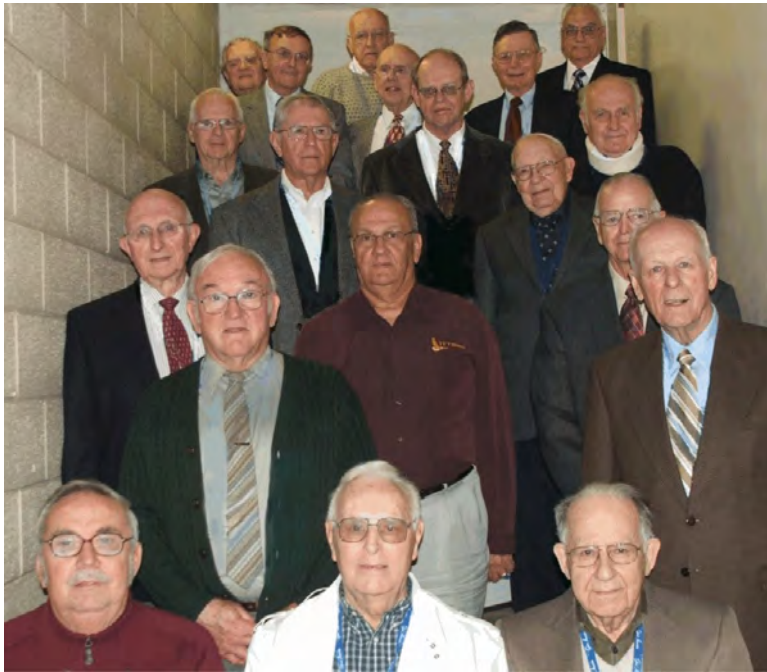
Retired Pastors (L to R)

The Board of Church Extension Ministries is the church planting arm of the BFC, seeking to “build the Body of Christ